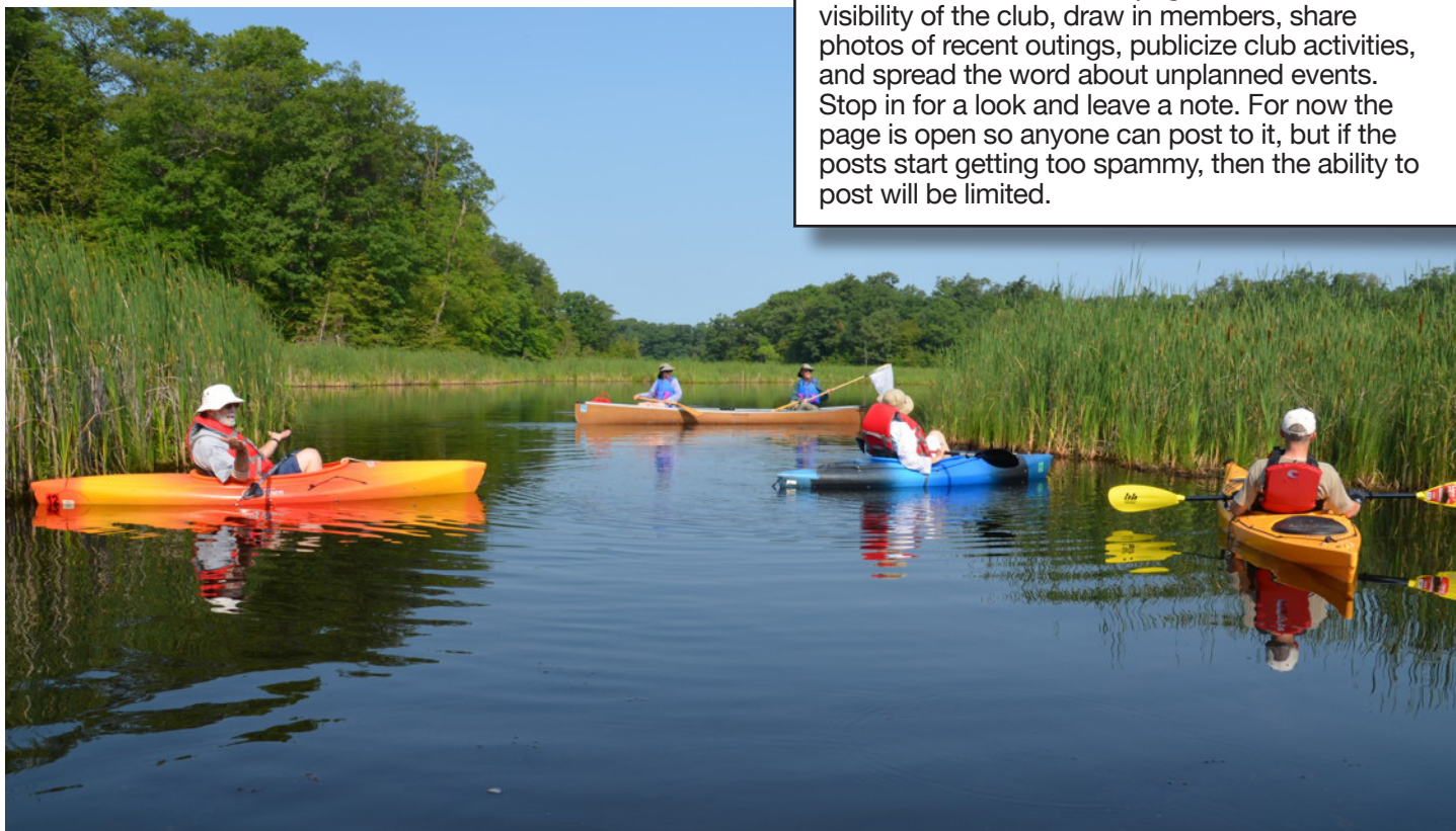
Dragonfly Catching Excursion, Summer 2012

We will be able to use the page to increase the visibility of the club, draw in members, share photos of recent outings, publicize club activities, and spread the word about unplanned events. Stop in for a look and leave a note. For now the page is open so anyone can post to it, but if the posts start getting too spammy, then the ability to post will be limited.