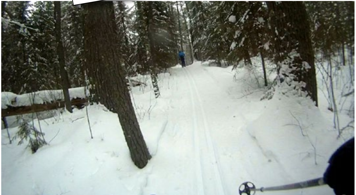
Action shot from DuNord